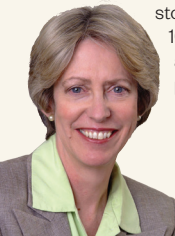
Patricia Hewitt (Labour), Secretary of State for Health from May 2005 to June 2007

April 2005: a new community pharmacy contract is introduced in England and Wales, which, for the first time, rewards provision of services as well as dispensing volume. The contract introduces essential, advanced (including medicines use reviews) and locally commissioned enhanced services