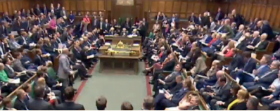
Jeremy Hunt (Conservative), secretary of state for health since September 2012